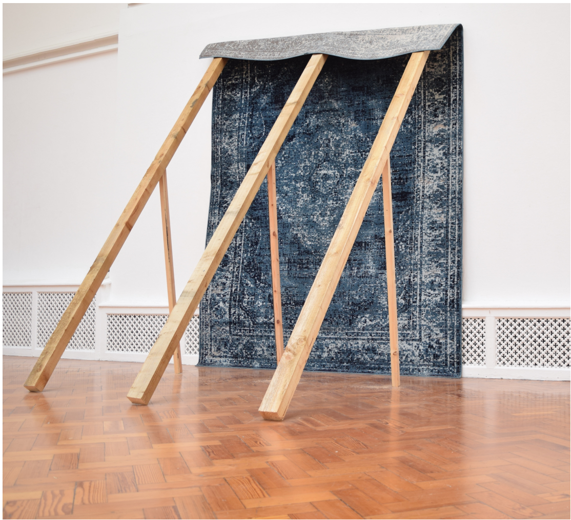
Falling , shaved carpet and timber