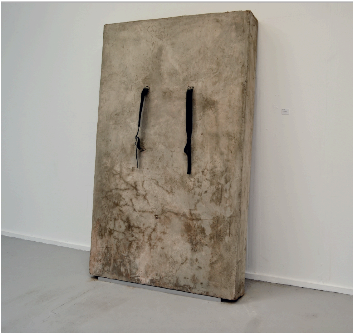
Backpack! When the borders born with you. Concrete, wood, strips .