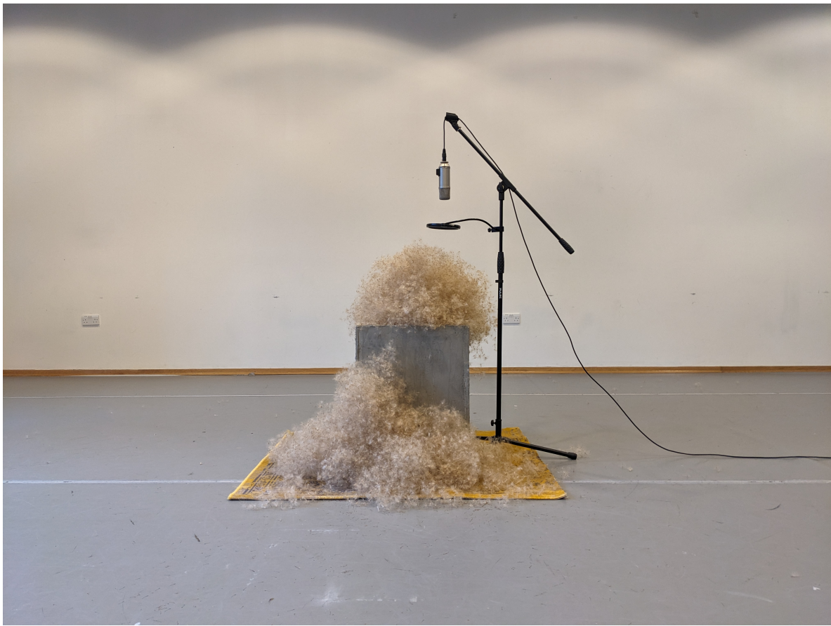
Recount your dreams! Dandelion seeds, concrete, rug, microphone.