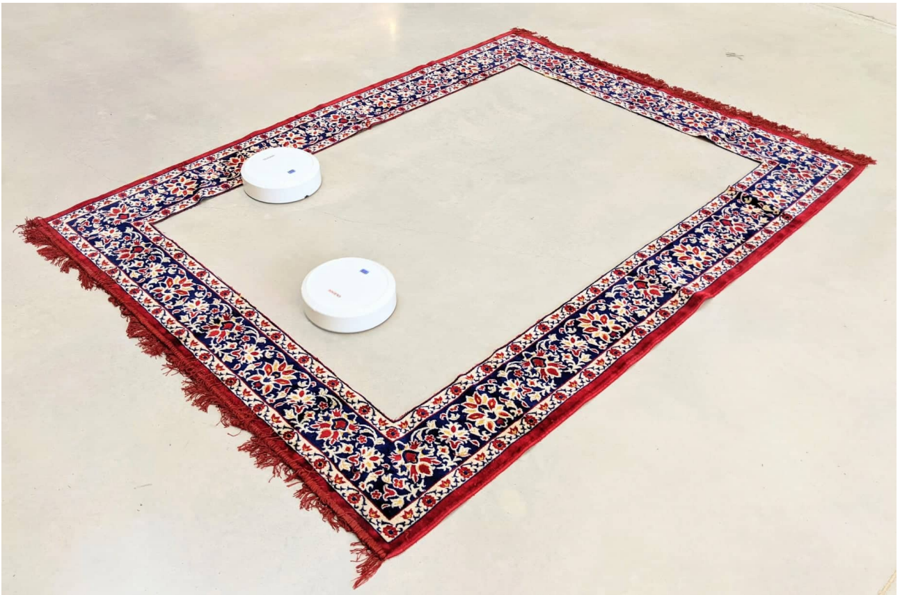
Everything is Fine! Carpet and Vacuums Cleaners Robots. Video